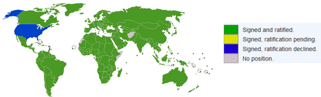
Figure 1 – Kyoto Protocol Participation

There are 192 parties committed to the Kyoto Protocol . This includes 191 states (all the UN members except Andorra, Canada, South Sudan and the United States) and the European Union . The United States signed but did not ratify the Protocol. Canada withdrew from Protocol in 2011.