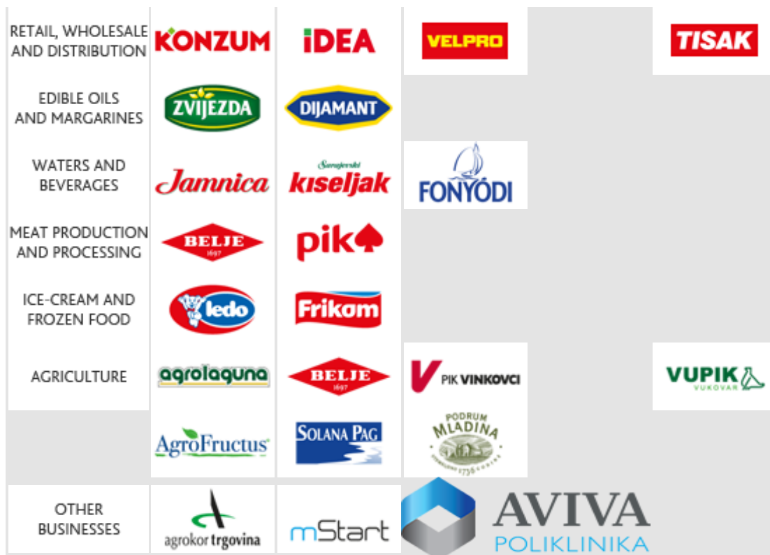
Figure 3: Agrokor Companies

mStart d.o.o. is a member of the Agrokor Group active since July 1, 2010 when the IT business was set up as a limited-liability company aimed at optimizing IT investments and upgrading the Agrokor Group's IT functions (Agrokor).