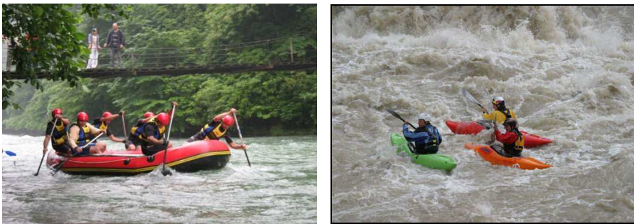
Photograph 6. Canoe and rafting are carried out in Firtına Stream especially in the period of transition from spring to summer.

As for river tourism, the area offers such alternatives as canoe and rafting thanks to the length of the course, flow rate and valley slope(Photo 6).