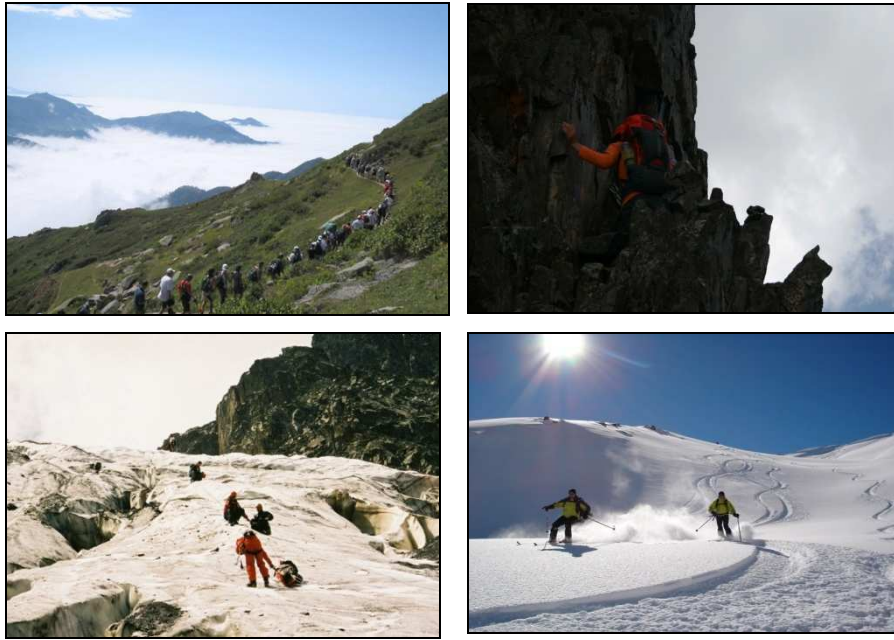
Photograph 2. The potential of the Kaçkar Mountains National Park in mountain tourism includes tracking and hiking, peak and glacial climbing and heliski.

The mentioned area has rural tourism facilities with its rural life style, traditional village and high pasture life, scattered settlement, houses built in accordance with wooden civil architecture, customs and conventions, garden and agriculture activities, and animal husbandry.