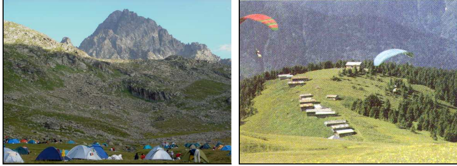
Photograph 7. Firtına Basin and Kaçkar Mountains National Park have places suitable for camping and paragliding.

As for as their height, slope and wind are concerned, the peaks of Kaçkar Mountains are suitable for paragliding (Photo 7). Sal, Pokut and Hazindak high pasture are among the appropriate places for this activity.