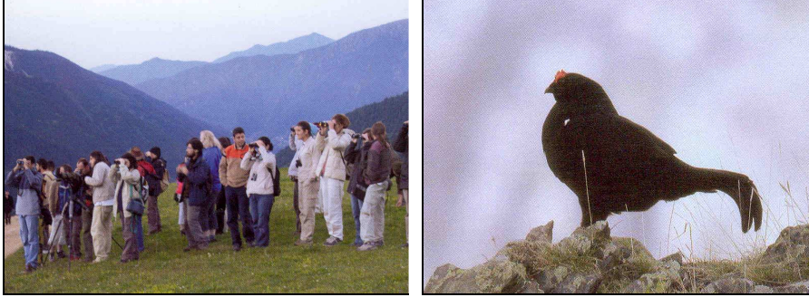
Photography 4. In recent years, bird watching has been carried out in Firtına Basin and Kaçkar Mountains National Park.

In addition, capercaillies in the area have given the area the status of being one of the 217 endemism areas (Kurdođlu, 2002: 5/Bird Life,1995).