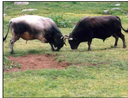
Photograph 1. Such Social and cultural activities as high pasture festivals and bullfights are organized in Fırtına Stream Basin and Kaçkar Mountains National Park.

Another important kind of alternative tourism is mountain tourism on the mountains with high peaks located in the south part of the basin. There are such summits as that of Mount Kaçkar (3932 m.) and of Mount Verçenik. The touristic potential of the park in mountain tourism includes tracking and hiking, peak and glacial climbing, mountain skiing and alpinism (Photo 2-Somuncu, 1986:1 - 1988: 30-31).