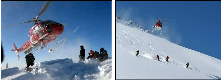
Photograph 5. The tourists landed on the peaks of Kaçkar Mountains join heliksi.

Since 2003, heliski has been available in the National Park(Photo 5). Tourists, especially from Sweden, Switzerland, Norway and Finland, join heliski activities which are mostly held on Kaçkar Mountains and such valleys as Kavran, Ceymakcur and Avacur.